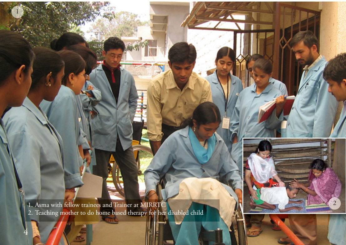
1. Asma with fellow trainees and Trainer at MIRRTC 2. Teaching mother to do home based therapy for her disabled child

DDP Partners' Training programme is an ongoing annual commitment in collaboration with Mobility India: it is also a very effective entry point for initiating new DDP partnerships and building more substantial programmes, examples of which are given on page 3.